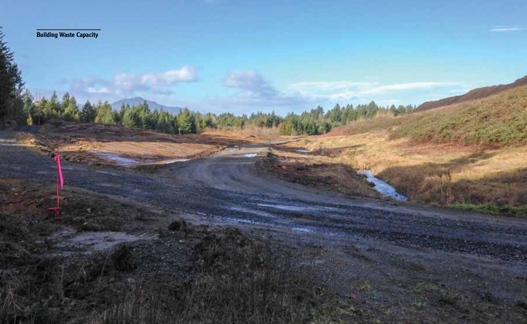
The modified landfill perimeter, used at Harmac, with a two-meter-wide berm and pipes used to collect and direct the surface water.